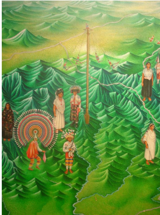
Detail from a mural in the Anthropological Museum of Mexico City. The four pole flyers and the priest are shown in the background.

The rhythmic pattern of the melody was based on the step size and depended crucially on the consistency of the flute tuning. I noticed among local instrument makers at Constitution Square that almost all the flutes are tuned differently, so it obviously does not really matter which special intervals are played just the direction –up or down– decides about correctness. This phenomenon is quite similar to dance steps that can vary individually. Most essential seems to be the step direction and intensity with which they are conducted. Pacing changed with synchronized dance steps following the pattern left-right-left-right-right, while the repeated right step precipitated more powerfully and took a longer span of time. At the end of a circumnavigation, the flyers stamped with their priest in synchronism to the drum beats in metric triple subdivisions with alternating step accents. Sometimes the flyers also turned themselves around in the same walking rhythm with their heads bowed to the axis itself. This short rotation is actually the remaining core of the ritual danced to the sun god. But this moment went so quickly and was so shy that it got lost in the general amazement. After a few repeats the flyers climbed up the pole equipped with ropes into the square frame crowning the pole.