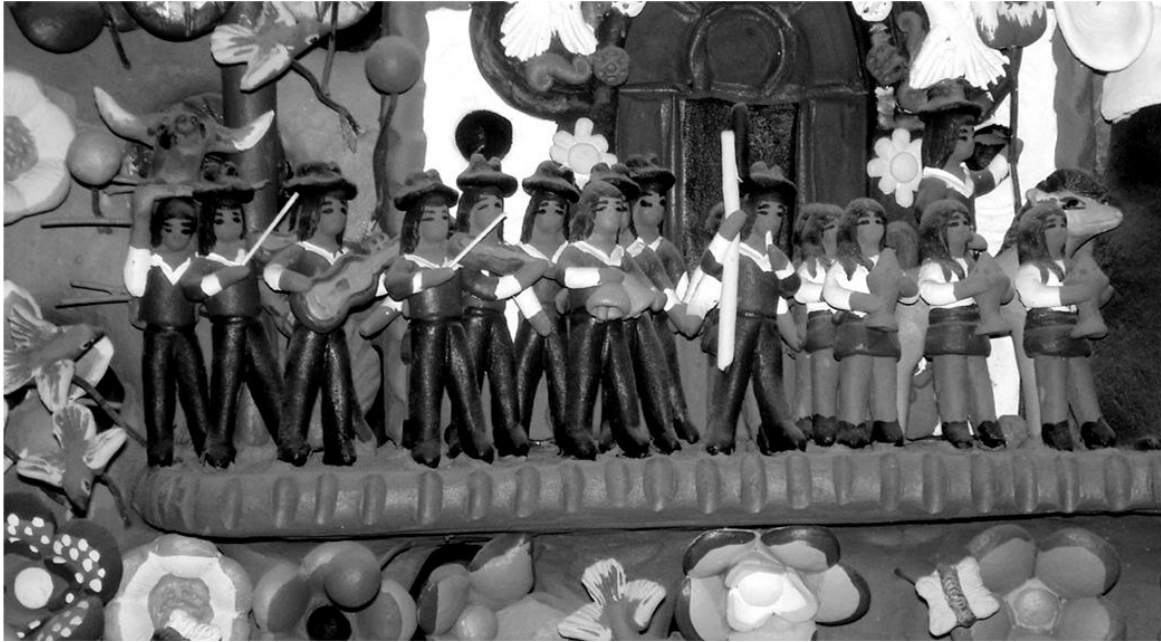
Detail from a decoration made of gypsum depicting a music ensemble in a procession. Anthropological Museum of Mexico City.

What will definitely stay is the irresistible benches in the public park of Chapultepec and the pole flyers who will make everyone believe they are experiencing something extraordinary.