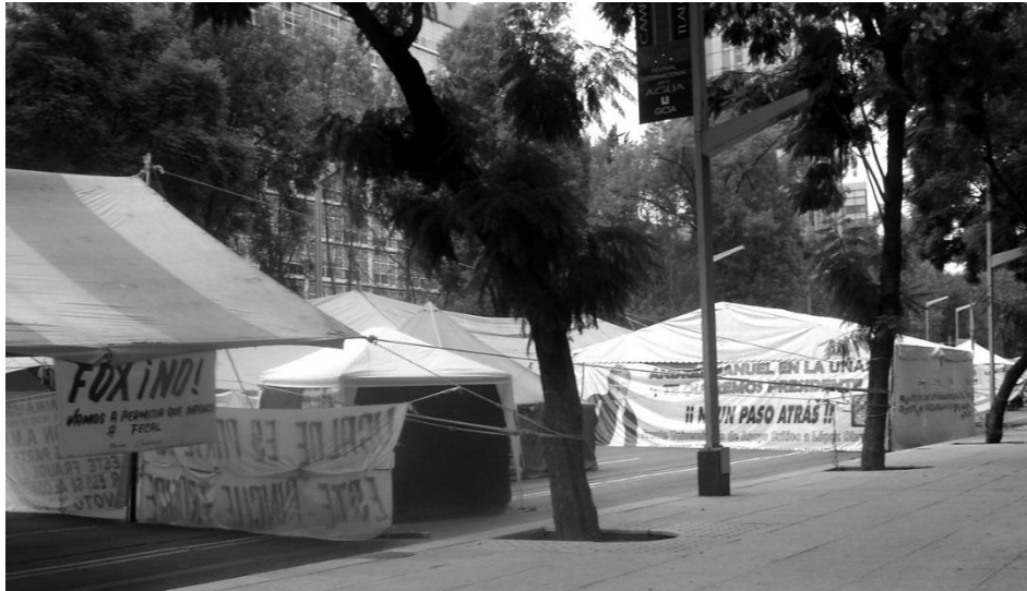
The Paseo de la Reforma of Mexico City, in September 2006 without any traffic.

This paper is to exemplarily discuss theoretical issues on cultural musicology (van der Meer and Erickson 2014) taking a holistic approach that includes analytic description, heuristics, source interpretation by means of the so called objective hermeneutics (Oevermann, Allert, Konau, and Krambeck 1987), and phenomenology. The abstract order of these methodological terms may turn out to be a pleasant personal prose on a visit to a city and the derivation of problem statements that finally lead to the proposed discussion on cultural musicology.